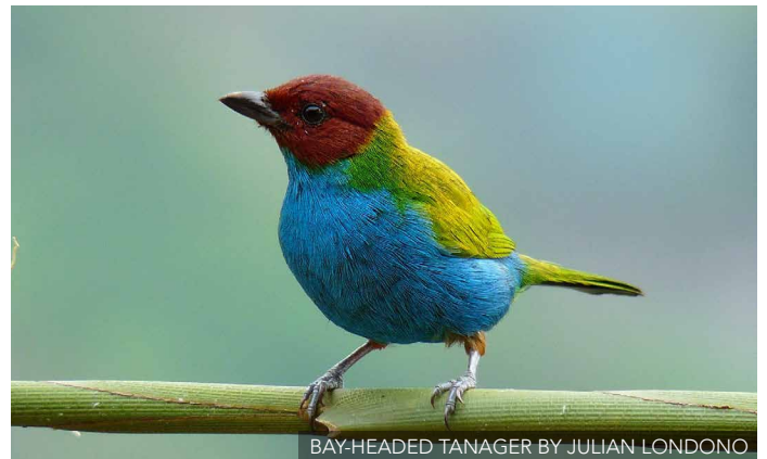
BAY-HEADED TANAGER BY JULIAN LONDONO

Early this morning, depart for El Valle de Antón, stopping along the way for birding at Altos de Campana, Panama's oldest national park. The cloud forest habitat at Campana harbors many middle elevation species including the Black-and-yellow Tanager, Plain Antvireo, Rufous-collared Sparrow, White-ruffed Manakin, White-throated Thrush, and Bay-headed Tanager. Bat Falcon, White Hawk,