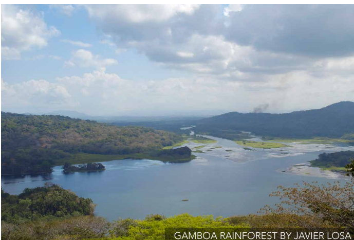
GAMBOA RAINFOREST

Depart El Valle early with a boxed breakfast and begin the journey to Gamboa. En route stop for birding at Juan Hombron for raptors such as the Savanna Hawk and, on occasion, the elusive Aplomado Falcon. Other specialties include Veraguan Mango, White Ibis, Glossy Ibis, Bran-colored Flycatcher, Mouse-colored Tyrannulet, Northern Scrub-Flycatcher, Bare-throated Tiger-Heron, Wood Stork, and Plain-breasted Ground-Dove. Check in and have lunch at Gamboa Rainforest Resort, and then have some time at leisure. Later this afternoon, set out for birding on the hotel grounds and the Waterfall Trail, looking for species such as Southern Nightingale-Wren, Olive Tanager, and Rufous-vented Ground-Cuckoo. Dinner at the resort. Overnight at Gamboa Rainforest Resort. (BLD)