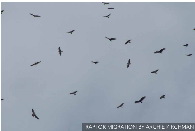
RAPTOR MIGRATION BY ARCHIE KIRCHMAN

Orientation to the program is followed by morning birding at the hawkwatch on Ancón Hill with Panama Audubon Society. Fall counts here usually exceed 1.5 million birds, concentrated between October 1 and November 18. The daily count record for this site was achieved on October 27, 2011, when 893,783 birds were counted. Be on alert for kettles flying over! This