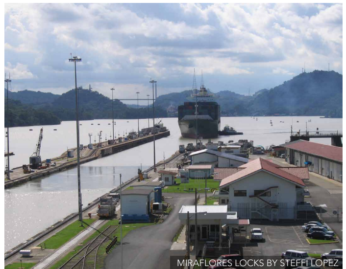
MIRAFLORES LOCKS BY STEFFI LOPEZ

Have breakfast at the hotel, and then transfer to the Panama Canal's famed Miraflores Locks. Explore the museum and hopefully see a ship pass through the locks. Lunch is at the on-site restaurant. This afternoon, take a field trip to the Rainforest Discovery Center, located at the world-famous Pipeline Road. The 100-foot-high observation tower provides a unique chance to observe birds residing in the upper stratum of the rainforest. Look for King Vultures and migrating raptors; other birds may include Mealy and Red-lore'd Parrots, Keel-billed and Yellow-throated Toucans, many species of tanagers, Blue Cotinga, Masked Tityra, and Green and Red-legged Honeycreepers. Continue birding along Pipeline Road, looking for Crested Eagles and Hook-billed Kites. Golden-collared Manakin, White-bellied and Blue-throated Antbirds, and Pheasant Cuckoo may also be seen. Return to the hotel for dinner. Overnight at Gamboa Rainforest Resort. (BLD)